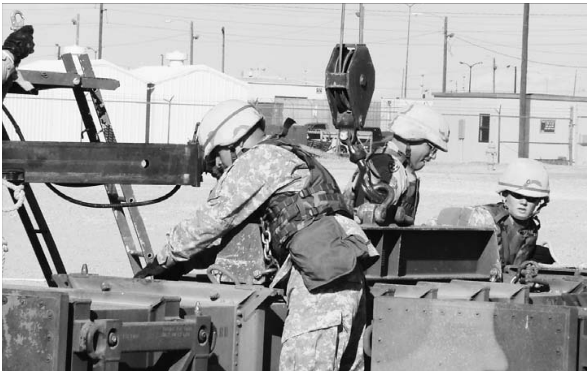
The reload crew works together in order to complete the drill.