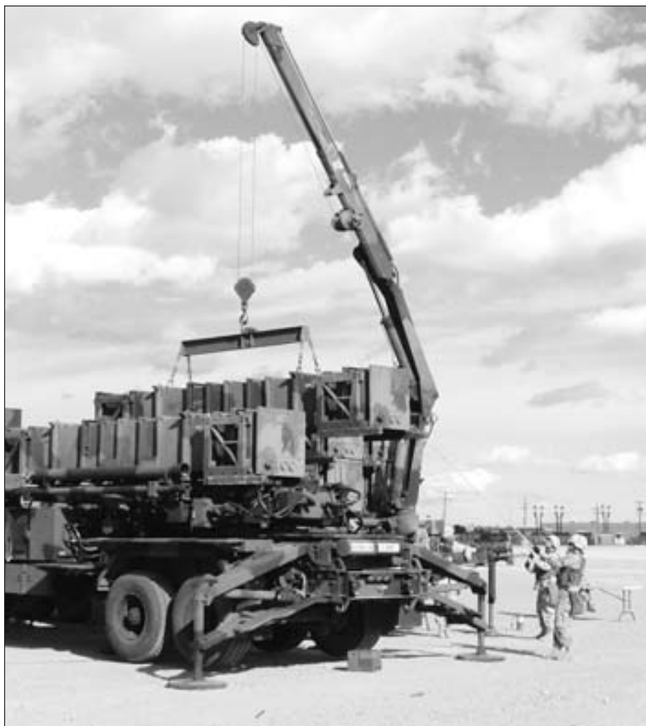
Soldiers guide a missile canister taken off of launcher.