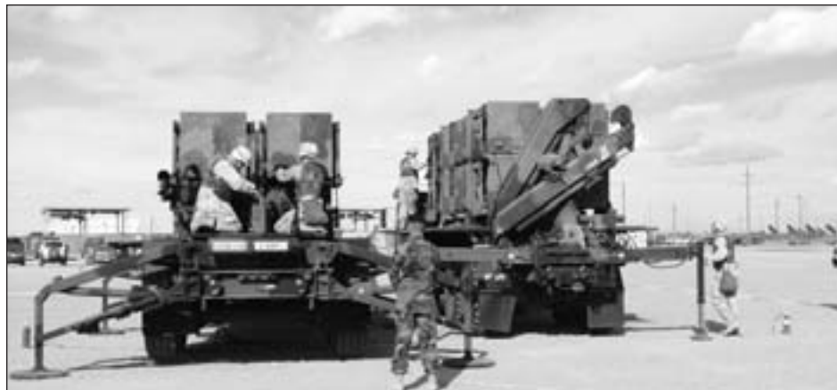
The C Battery, 1st Battalion, 1st Air Defense Artillery's reload crew prepares to transfer missile canisters before the evaluator.