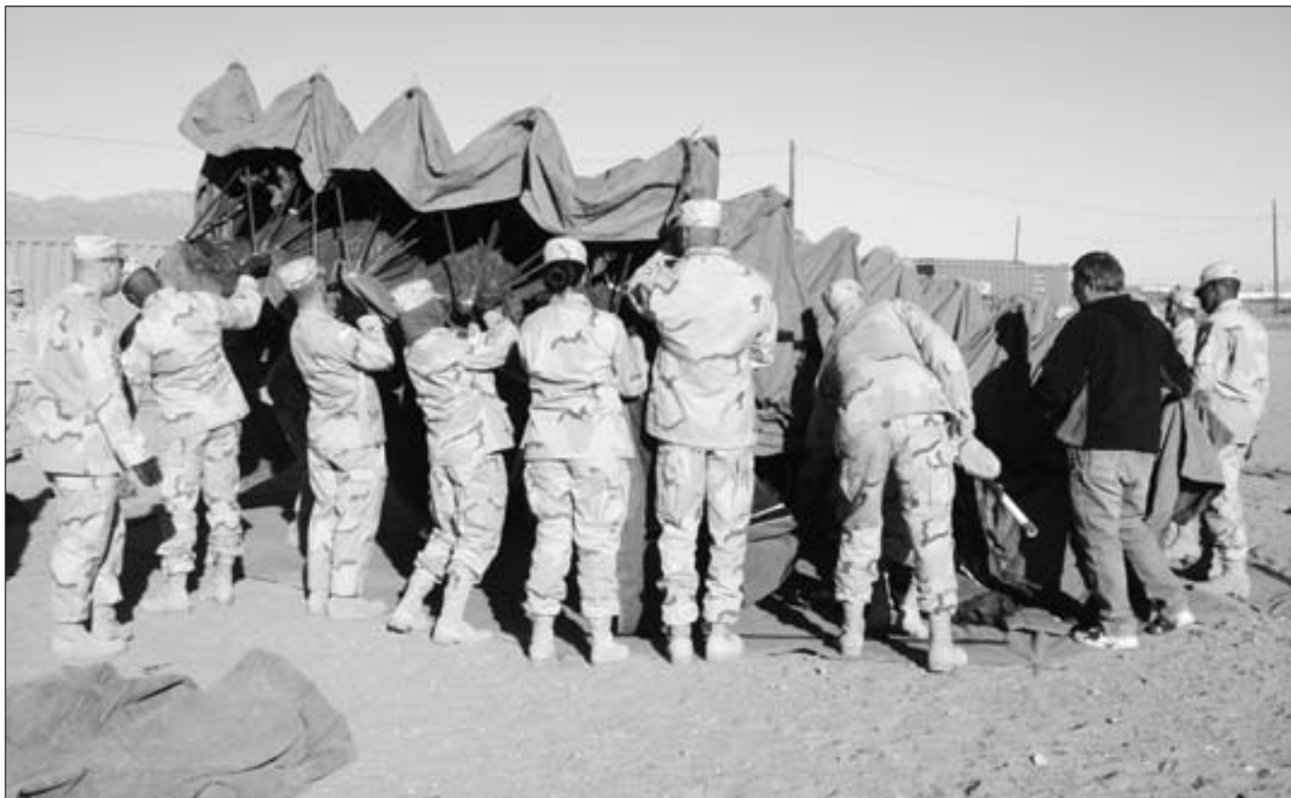
PFC. RACHAEL ESTES

"Our enemies will probably have weapons of mass destruction, especially chemical weapons with blister, blood, choking and nerve agents,"