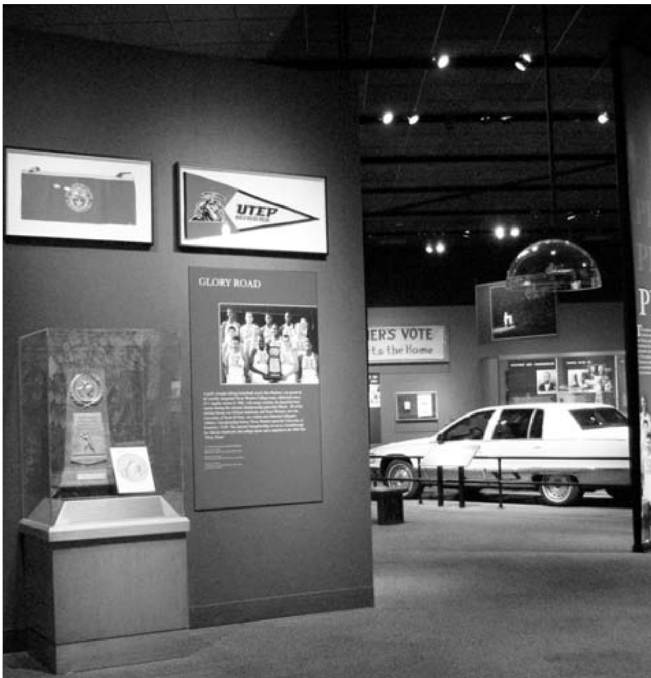
Within the "Pride" section of the exhibit this area tells the Glory Road story. The entire exhibit is on display at the Texas State History Museum in Austin.

For more information about "Glory Road" and the Texas Western team, visit www.utep.edu/gloryroad .