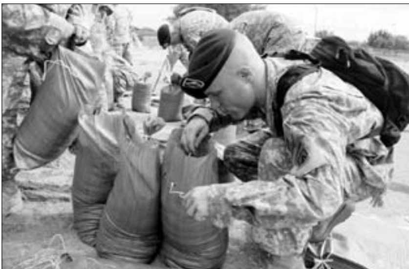
"Strength in Honor" Soldiers almost empty sand from a metal container. The 2-43 ADA Soldiers filled nearly 2,000 sandbags in one hour.